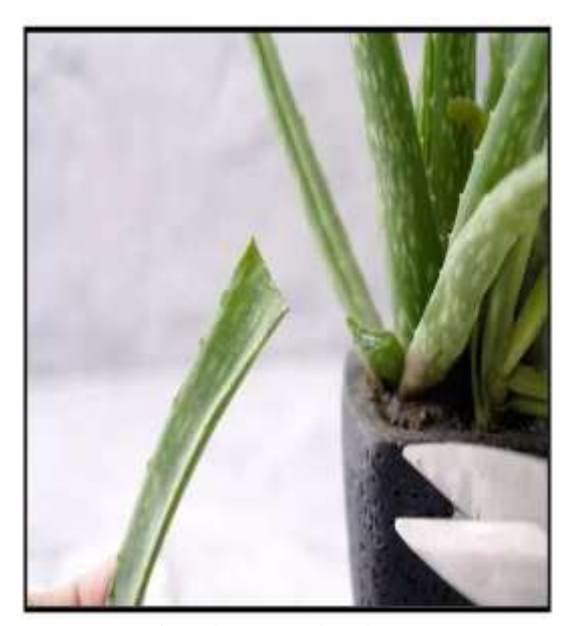
Fig. Aloe vera plant leaves

The Aloe vera plant has been known and used for centuries for its health, beauty, medicinal and skin care properties. The name Aloe vera derives from the Arabic word "Alloeh" meaning "shining bitter substance," while "vera" in Latin means "true." 2000 years ago, the Greek scientists regarded Aloe vera as the universal panacea. The Egyptians called Aloe "the plant of immortality." Today, the Aloe vera plant has been used for various purposes in dermatology.